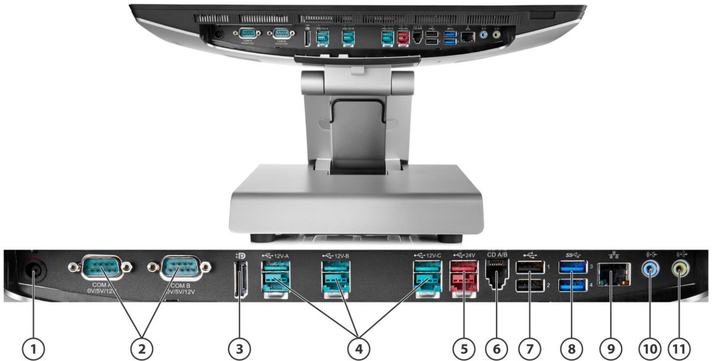
Image shown with ergonomic stand